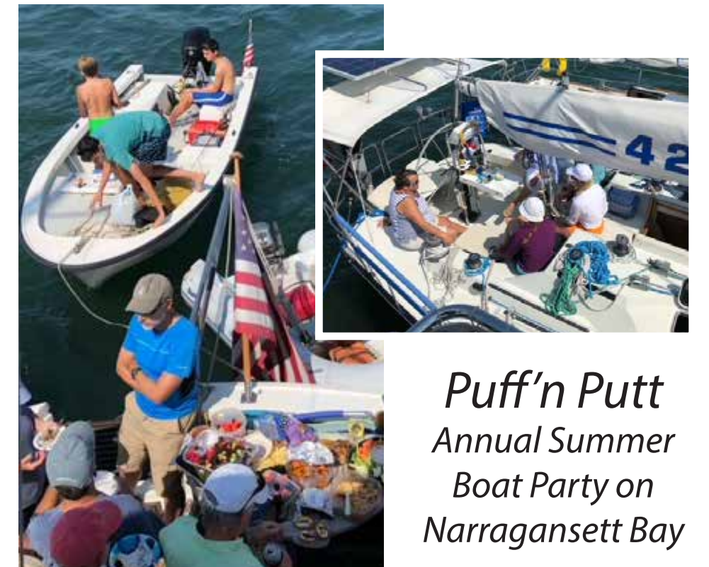
Puff'n Putt Annual Summer Boat Party on Narragansett Bay