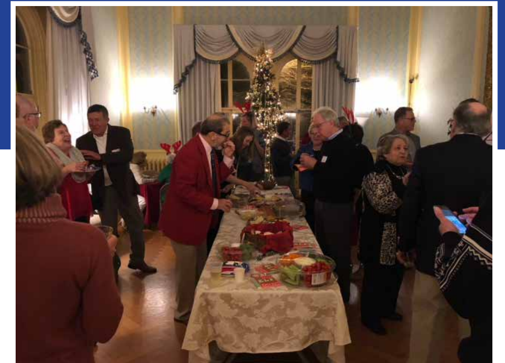
Annual Holiday Party Edward King House, Newport, RI