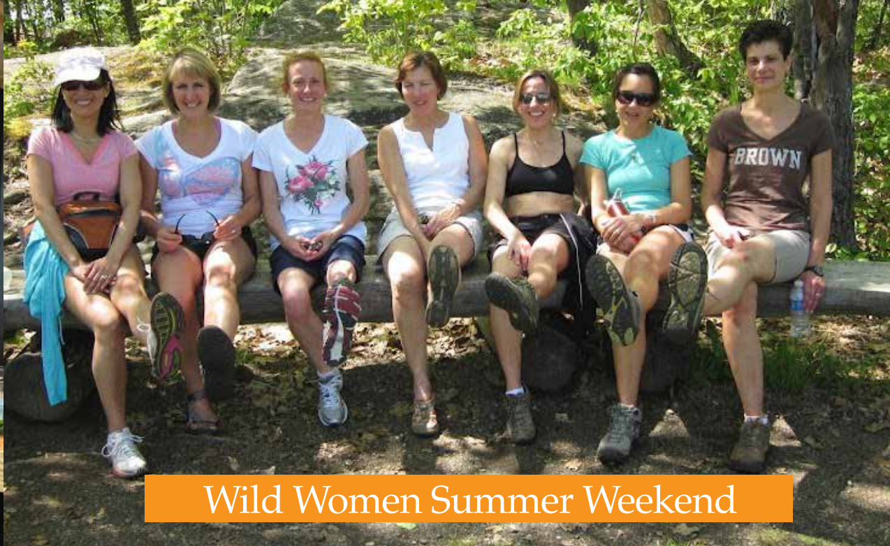
Wild Women Summer Weekend

“You’ll meet people who’ll become your ski-buddies and lifelong friends.”