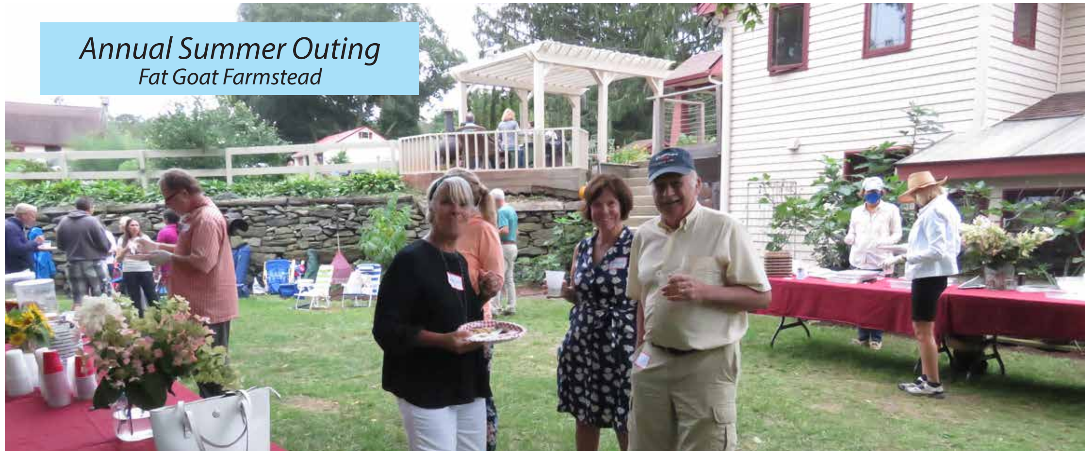
Annual Summer Outing Fat Goat Farmstead